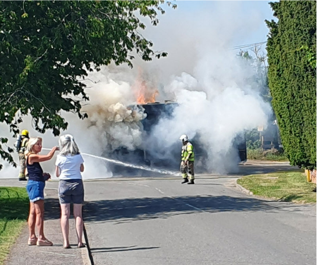
Horse box fire in Oxhill on 27 May 2026. Photo by Tony Philpott